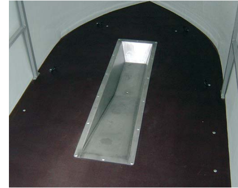
Tray for bikes higher than 150 cm

On inquiry we can offer further solutions to extend the usefulness of the trailer.